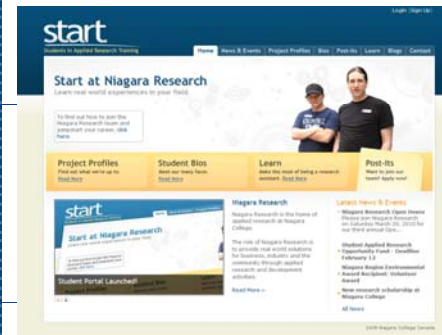
Front page of student portal

This system was adapted by several colleges throughout Ontario and phase 2 of the student portal is now underway.