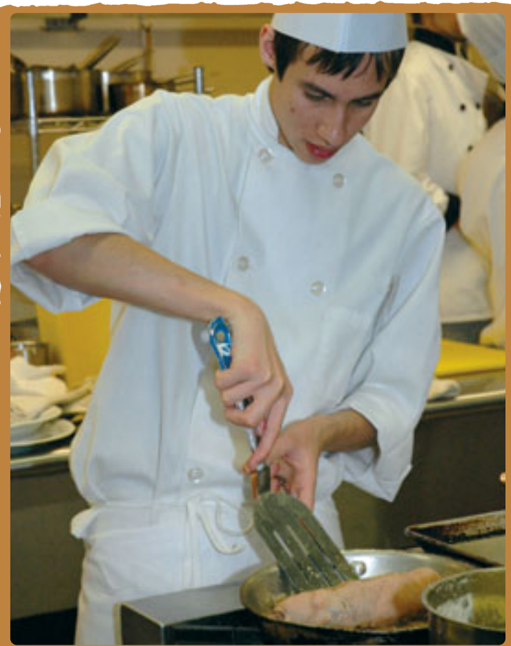
More than 50 high school culinary students were at the Niagara Culinary Institute March 1 for the third annual Niagara Invitational High School Cookoff. Students competed in culinary and baking categories, and top performers received Niagara College scholarships. In all, 17 secondary schools were represented at the event.