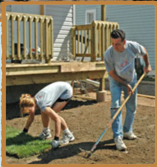
Left: Niagara College students lend helping hands to Habitat for Humanity Niagara. Students and instructors have worked hard to make the dream of homeownership a reality for a local family. A Dedication Ceremony at the Welland address marked the completion of this inaugural build with Habitat for Humanity Niagara, Niagara College and Niagara Home Builders' Association – truly a momentous occasion.