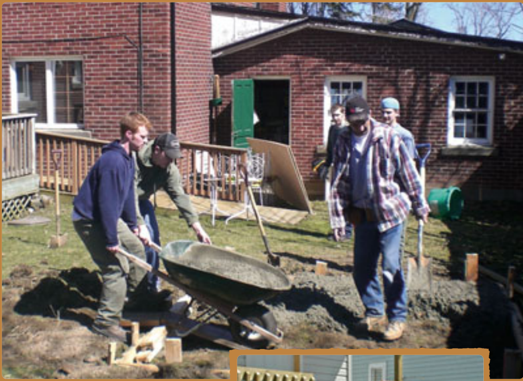
Above: The Head Injury Association of Fort Erie (HIAFE) was the recipient of this year's Many Hands project. Students from Niagara College's Event Management (Graduate Certificate), Construction Techniques and Construction Engineering Technology (Architecture) programs, along with 80 volunteers conducted a one-day renovation blitz at HIAFE's facilities on March 31.